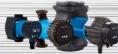
NMT (electronic savings, ECM, SAN circulation for sanitary water)