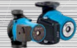
GHN (3-speed pumps)